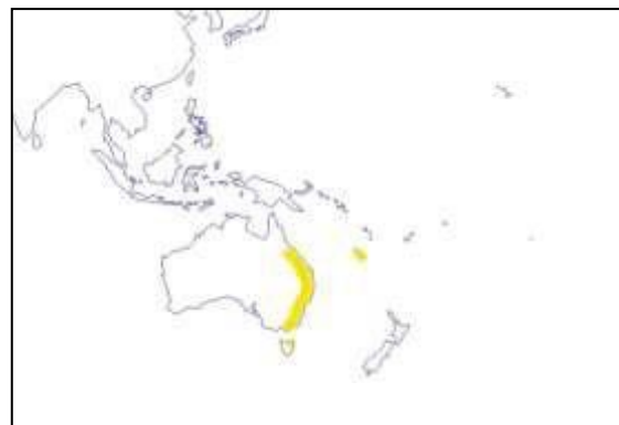
Distribution of Queensland Fruit Fly shown in yellow

It is also established in New Caledonia and the Austral Islands. It is usually found in the warmer areas of Australia but has been found in Tasmania indicating that adult fly may be able to establish in New Zealand especially in the warmer regions.