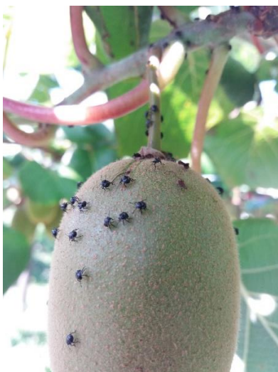
Green vegetable bug nymphs

Growers, contractors, and people who work on-orchard are the key line of defence and are best-placed to spot invaders early on.