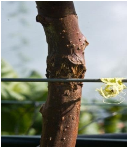
Gold 3 cane rubbing on a wire