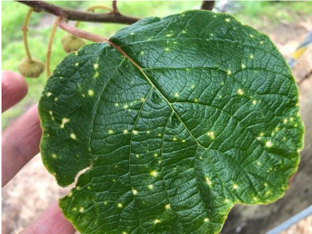
White spots on leaves