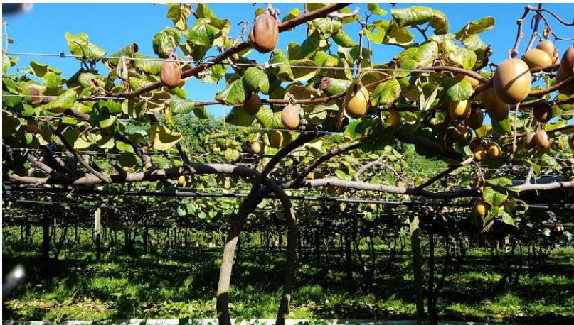
Yellowing leaves and fruit collapse