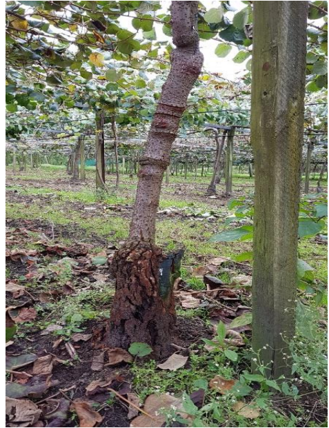
Sick plant believed to be phytophthora