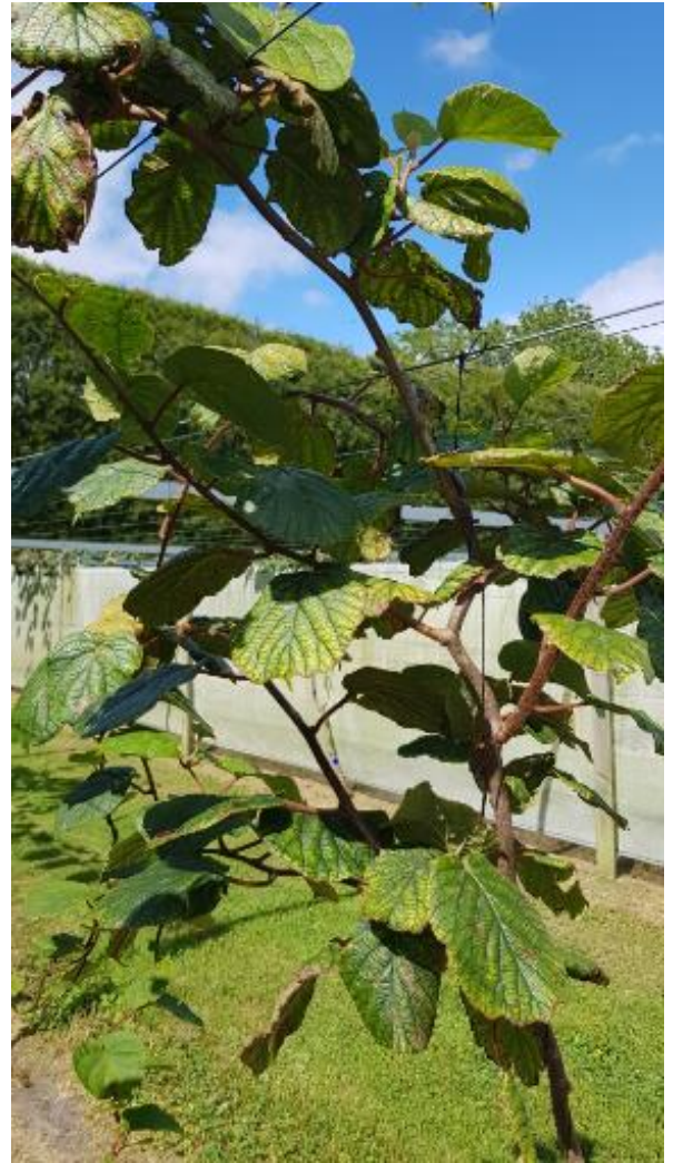
Yellowing and dead tissue on leaf edges