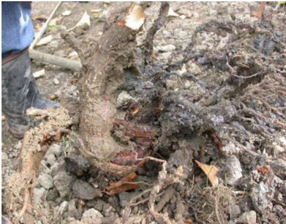
Phytophthora - rot of lower main roots