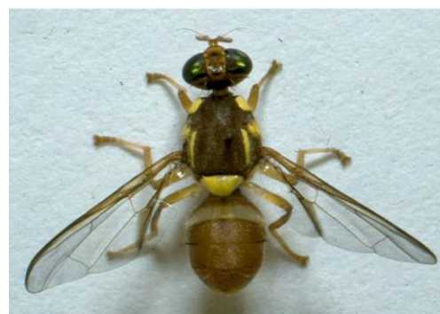
Queensland Fruit Fly