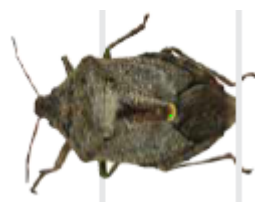
Brown soldier bug 15mm