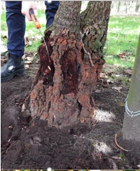
Trunks with orange mottled lesions