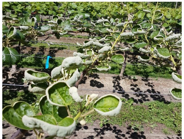
Cupped leaves due to off-target herbicide or growth regulator damage.