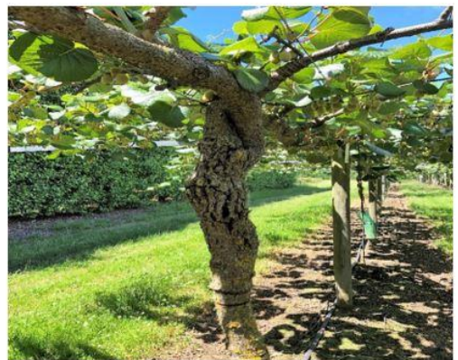
Swelling/cankers on trunks and leaders