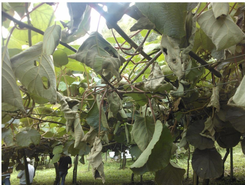
Figure 3: Wilting is an early sign of Ceratocystis fimbriata