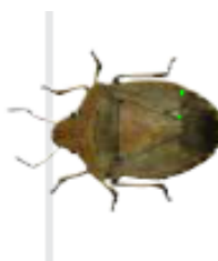
Brown Shield bug 10mm