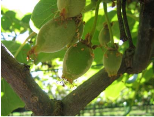
Figure 2. Partial fruitlet coverage.

Poor coverage is most commonly seen on the sides of leaves, fruit or wood that were facing away from the sprayer. These gaps are caused largely by the sprayer output air and droplets separating around the obstruction and leaving a “shadow area” in behind.