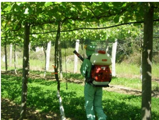
Figure 1. Application to the point of spray runoff for chemical efficacy trial work.

(Top) Handgun application to replicate bays in a kiwifruit orchard.