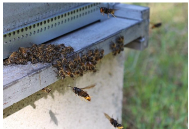
Photo: Hunting behaviour of the Asian Hornet, showing the size difference between hornets and honeybees.

Honeybees are already facing numerous threats in New Zealand without the risk of further impacts from pests such as the Asian Hornet. Furthermore, by nesting in urban areas, the Asian Hornet (which is well known for its aggressive behavior), is a potential threat to human activities also.