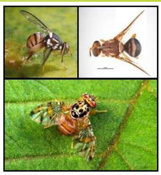
Figure 1. Adult specimens of fruit fly; Oriental Fruit Fly (top left), Queensland Fruit Fly (top right) and Mediterranean Fruit Fly (bottom).

Horticulture Innovation Australia estimates the annual cost of control measures, lost exports and contaminated produce related to the QFF is at least A$150m. Should a breeding population establish in Te Puke economic impacts are estimated to be $100-$400 million.