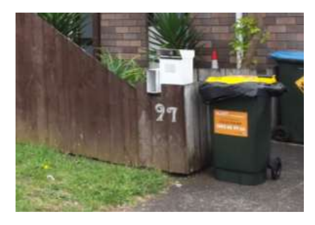
Fruit collection bin within Zone A