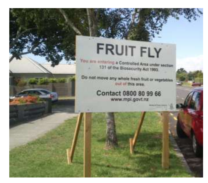
Fruit fly signage in Zone B and at Zone B boundary