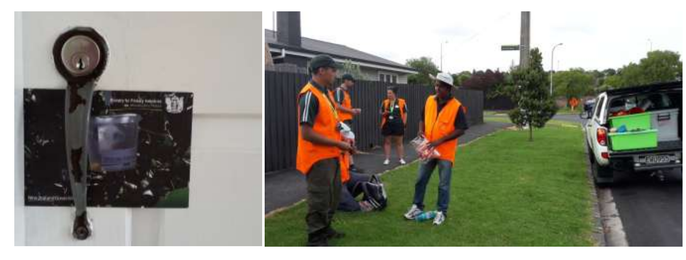
MPI calling card