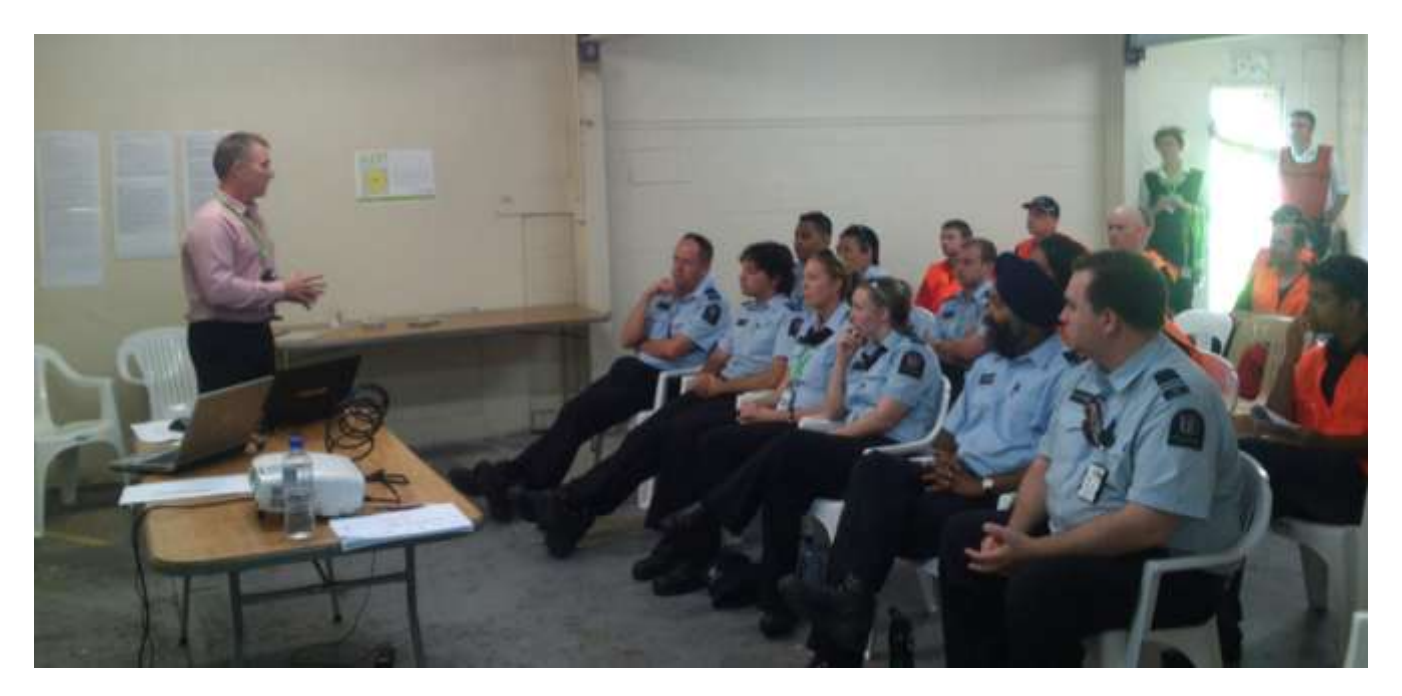
Staff briefing at response HQ, prior to Cricket World Cup match