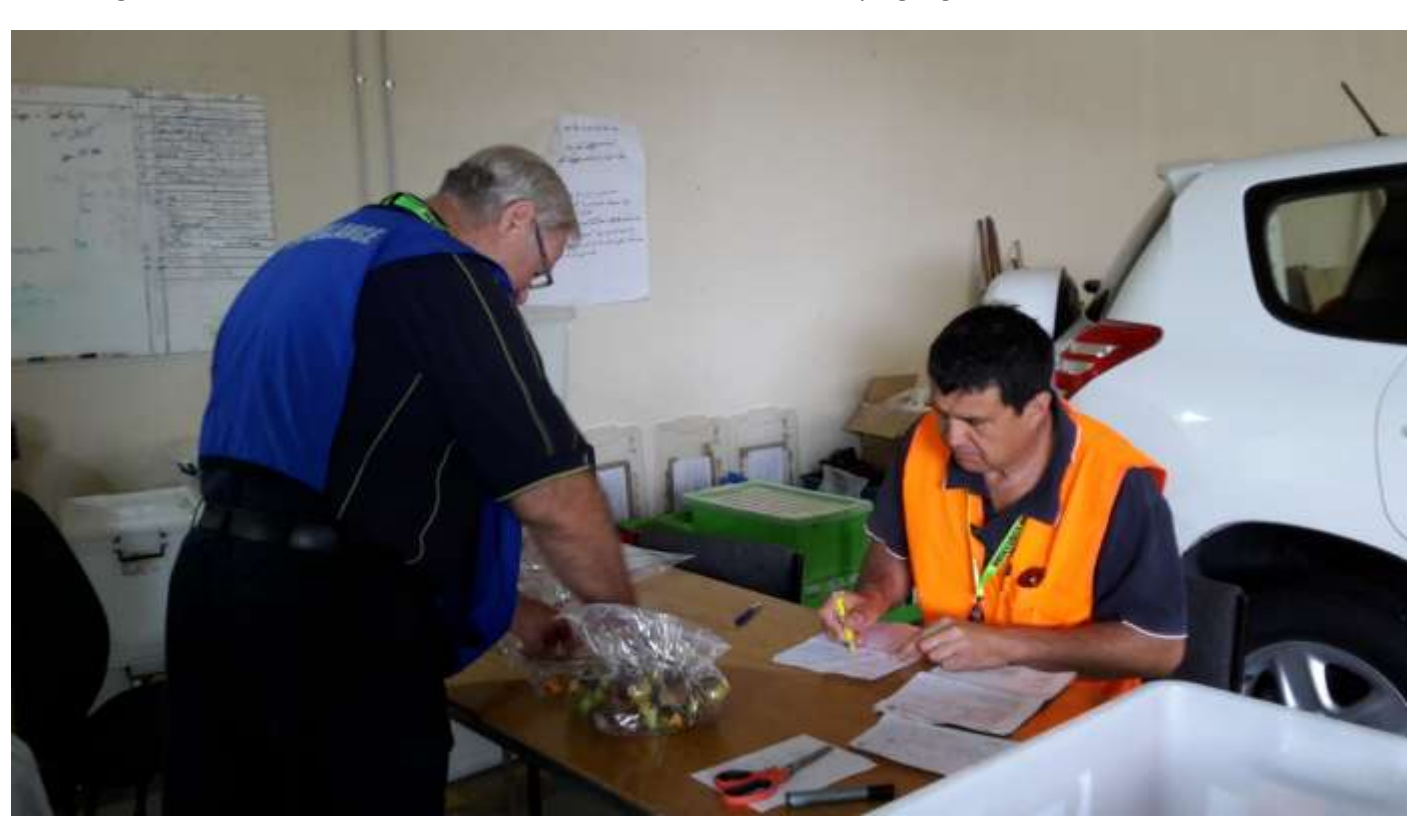
Checking collected fruit