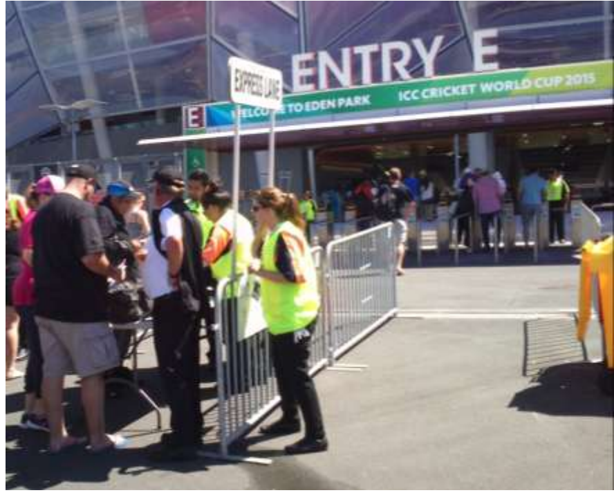
Auckland Council civil defence volunteers ensuring fruit is intercepted at the alcohol check point.