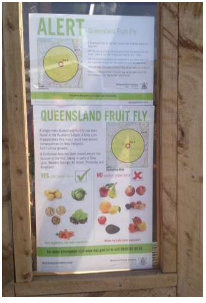
Fruit fly signage at Zone B boundary