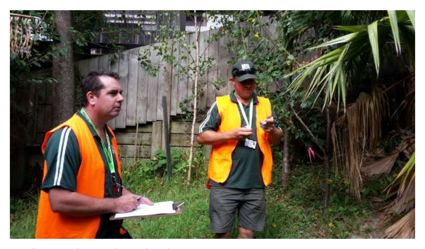
Surveillance teams logging and tagging host plants