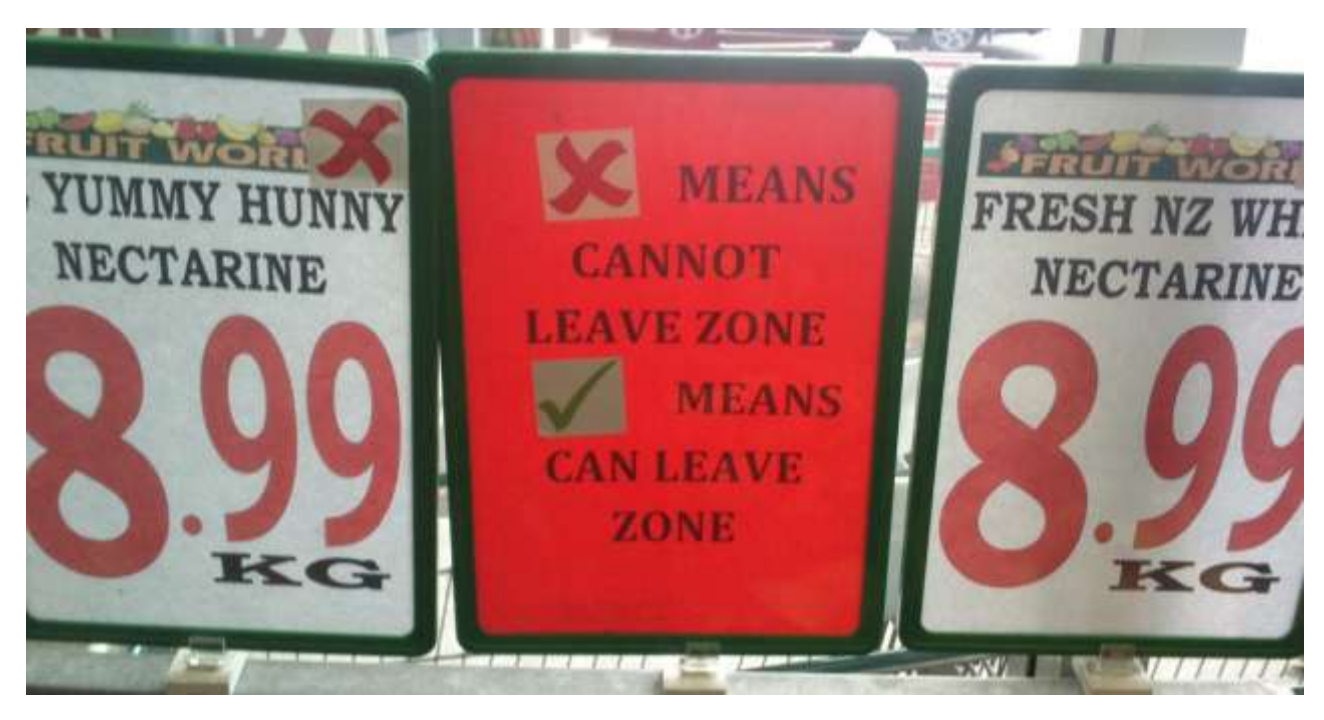
Signage explaining 'tick and cross' movement control system at fruit & vege shop