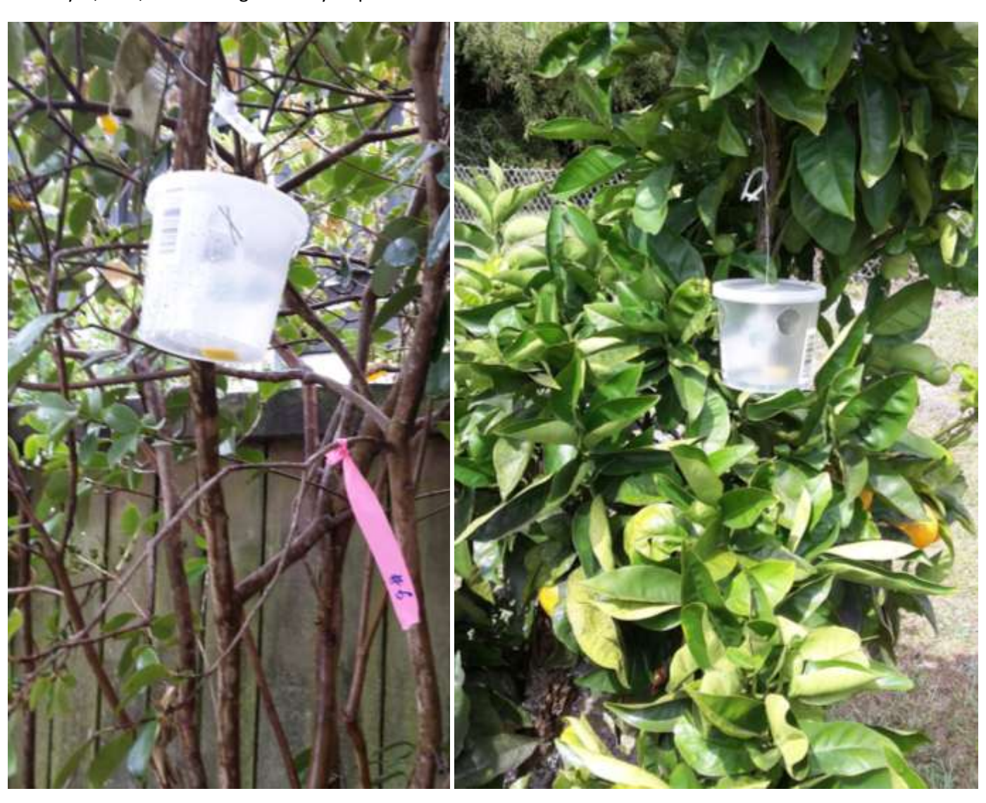
Fruit fly traps in host trees