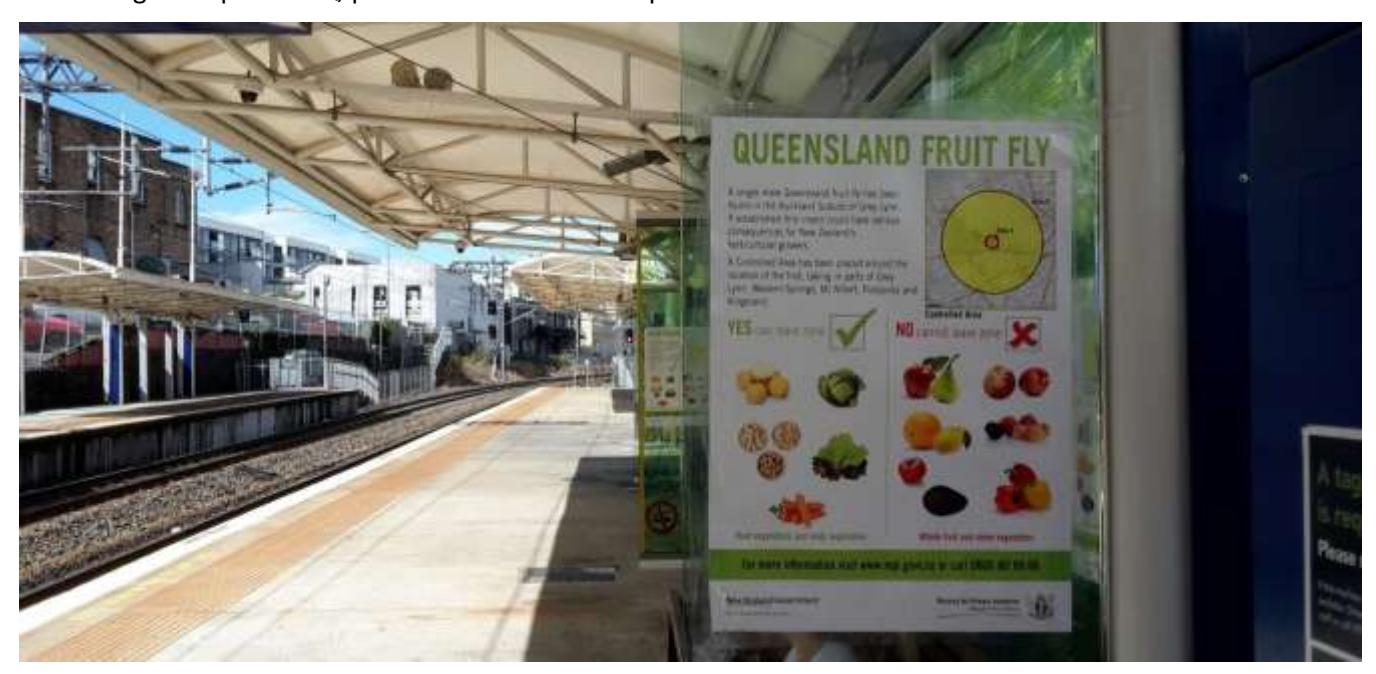
Fruit fly signage at train station, Eden Park