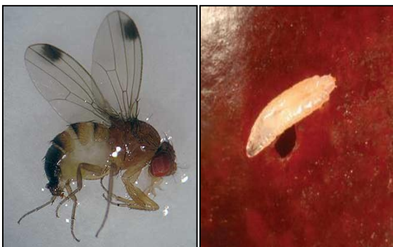
Adult SWD fly with black wing spots (left) and larvae (right)

SWD are small yellowish-brown flies with red eyes, 2 to 3mm in length. The most distinguishable trait is that adult males have a black spot towards the tip of each wing. Larvae are milky white, cylindrical with black mouth parts and between 1 to 6 mm in length.