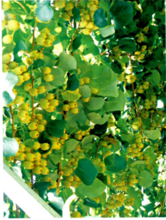
Fruit size and crop load 19 December 2011