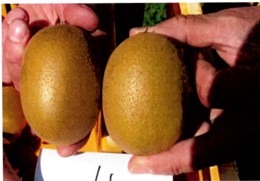
Examples of fruit with fruit speckle – raised lenticels