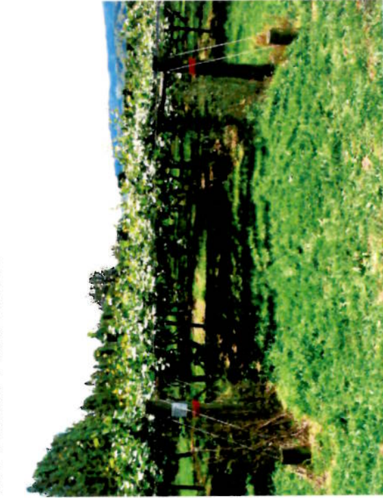
General View of Trial 19 December 2011