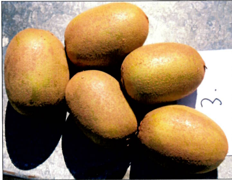
Examples of fruit from treatment 1 (36 DAFS) with russet

As the first planned application timing 7-14 days post fruitset was not applied it is not possible to determine whether there is a safe period for Nordox application following fruitset.