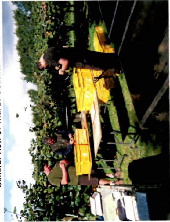
Fruit assessment 2 May 2012