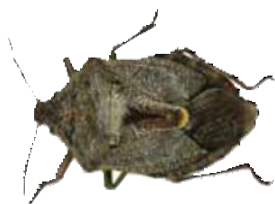
Brown soldier bug ( Cermatulus nasalis )