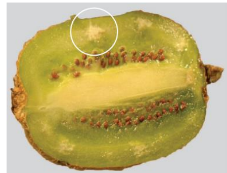
Figure 2. BMSB feeding damage to Hayward kiwifruit from a laboratory trial (UCR, CA)

Adults are mobile and readily move from plants with early ripening fruit to ones with later ripening fruit. They seek shelter in houses/protected areas in autumn/winter. Egg masses and nymphs may be seen on the undersides of leaves.