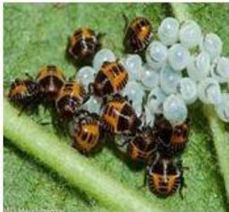
Figure 1. Adult BMSB with ruler to indicate large size (top), nymph and egg mass (bottom).

BMSB can hitchhike on inanimate objects such as cars and shipping containers from Asia, the USA and Europe. If it were to enter New Zealand it would have no problem establishing due to our highly suitable climate and abundance of host material. Its entry and establishment would result in significant production impacts to many horticultural industries.