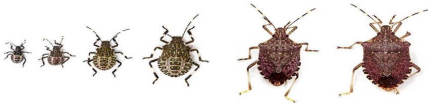
Figure 4. Nymphal stages of BMSB. 2nd to 5th instar, adult male and adult female.