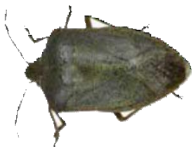
Brown form of green vegetable bug ( Nezara viridula )