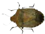
Brown shield bug ( Dictyotus caenosus )