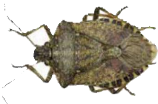
Brown Marmorated Stink Bug ( Halyomorpha halys )